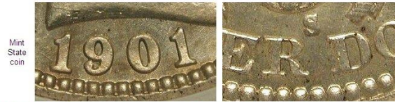
Mint State coin

Obverse B: Both 1's are centered over the left side of denticles, second 1 is not close to the bust (much lower than Die A). Reverse B: S is more upright and nearly centered between R and D. Note: Use extra caution here, as there is also at least one 1901-P date position that is close to the 1901-S Obverse Die B, although not exactly the same.