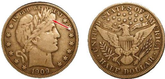
Very Fine (VF 20). All of the letters of LIBERTY will be easily visible. Still more detail in laurel wreath. On many dates, the band under LIBERTY (see arrow) will be complete on VF30 coins (VF-EF). On the back, most of the feathers will be visible.