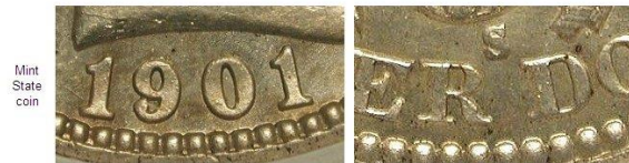
Obverse B: Both 1's are centered over the left side of denticles, second 1 is not close to the bust (much lower than Die A). Reverse B: S is more upright and nearly centered between R and D. Note: Use extra caution here, as there is also at least one 1901-P date position that is close to the 1901-S Obverse Die B, although not exactly the same.