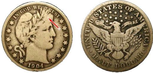
Fine (F 12). On the front, all of the letters of LIBERTY will be visible, but the bottoms of a couple letters may be very weak or missing. Laurel wreath has more detail. On the back, about half the feathers and most or all of E PLURIBUS UNUM will be visible.