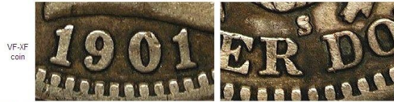
Obverse A: Both 1's are centered over a denticle, second 1 is close to the bust. Reverse A: S is somewhat tilted and closer to R than D. Note: A recently discovered 1901-P obverse die is a very close match to this die. Use careful attention when authenticating this coin. See "Sample fakes" below.